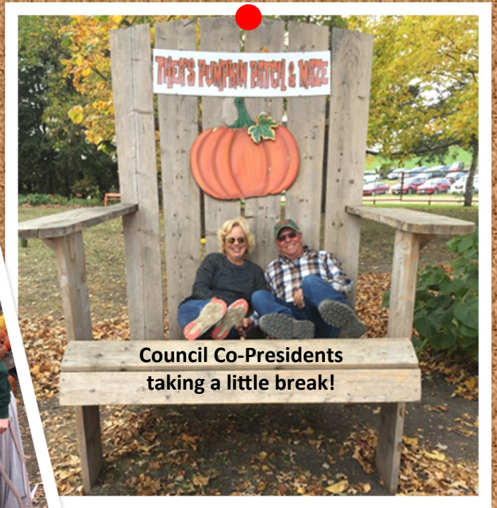
Council Co-Presidents taking a little break!