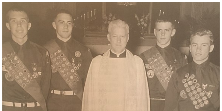
Boy Scouting Honors given in the 1960s to four First Lutheran youth