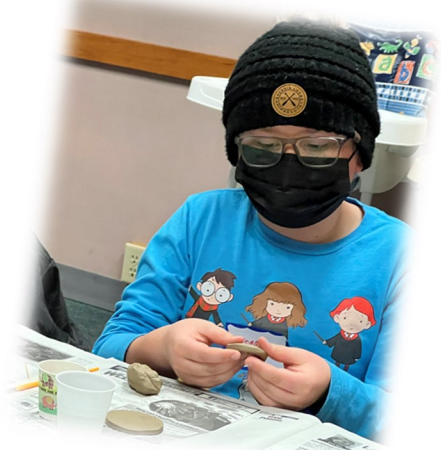
5th Graders and their families making their clay chalice for First Communion.