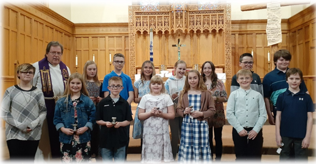
5th Grade First Communion held on Maundy Thursday