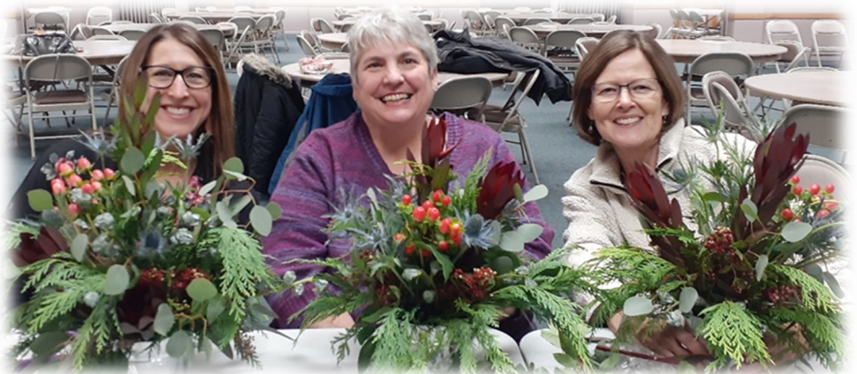
Creative Fun at Christmas Flower Arranging Class on December 7th!

First Lutheran follows the Fergus Falls School District #544 for closures, late starts, early dismissals and after school activity cancellations. This information can be found on the school website or Facebook page, and local radio and news stations.