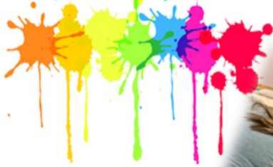
Artists at work!