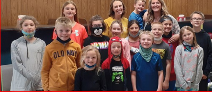
Last Day of FLY K-6